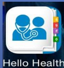
Portal Connect App